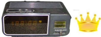
Alarm radio ACN-001