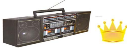
Stereo with cassette tapes